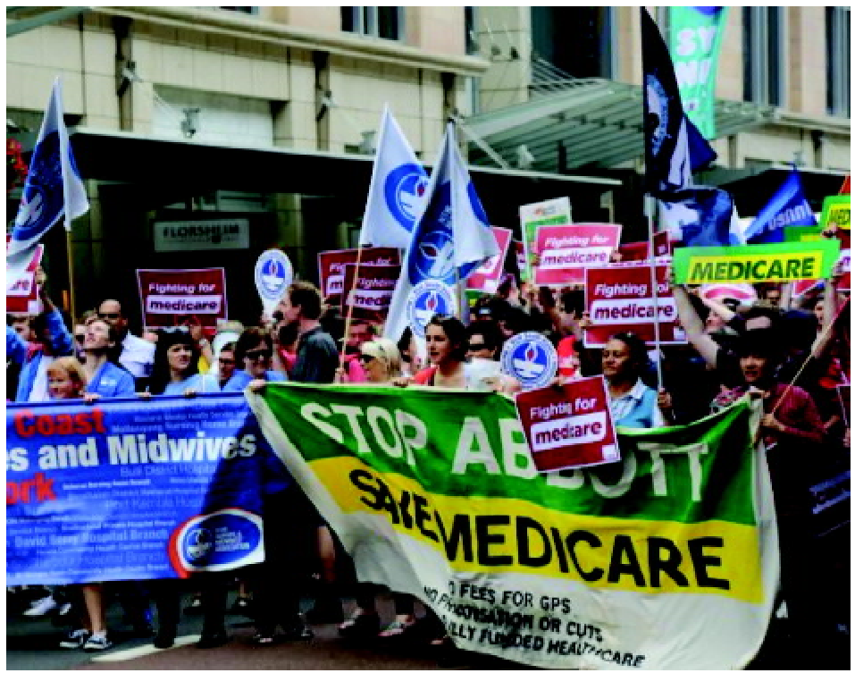
Save Medicare rally, Sydney, 2014.

Unions and the community need to take a firm stand against these new restrictions on the free speech of public servants. This attack is part of the preparations by the government to launch huge assaults on workers and the Australian public, and to try to limit the ability of workers to be involved in defending the community and themselves.