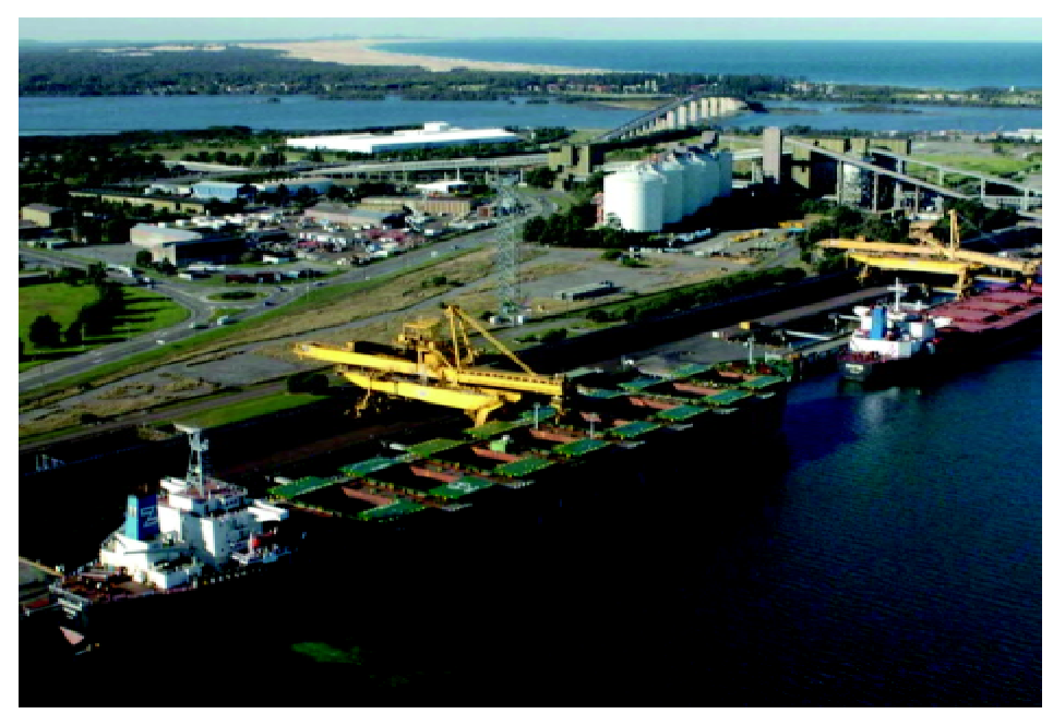
Port of Newcastle.