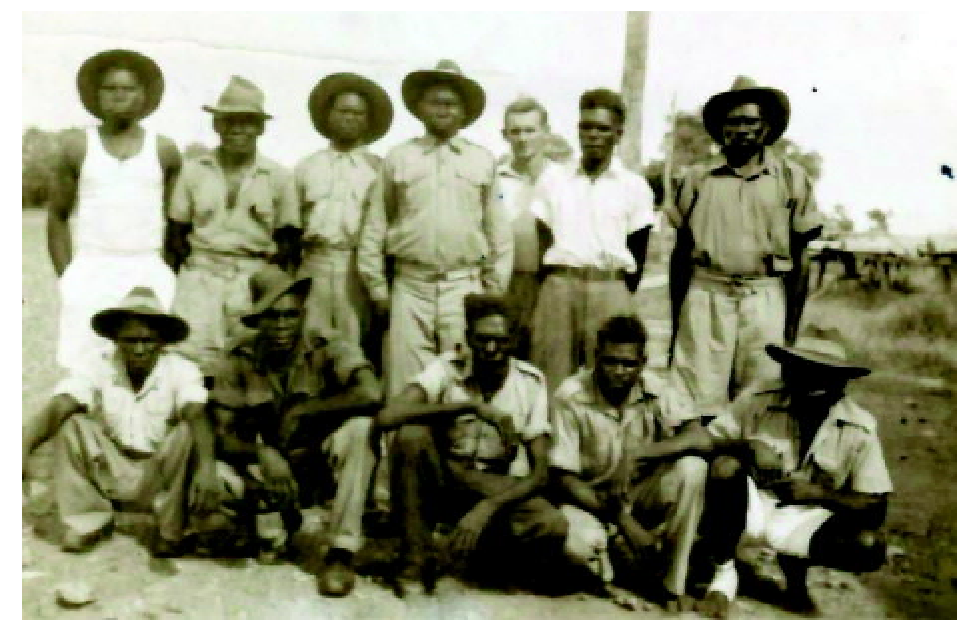
Strike committee of Aboriginal workers, Darwin, 1946.