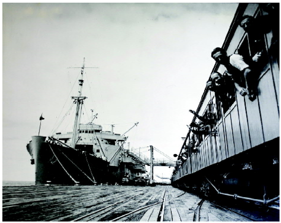
Hungarian immigrants leaving Melbourne for Bonegilla camp, 1947.

policy of political trade unionism was not limited to the ALP's mild reform goals. It envisioned a more active role, where trade unions would use their industrial strength to pursue their political ideals."