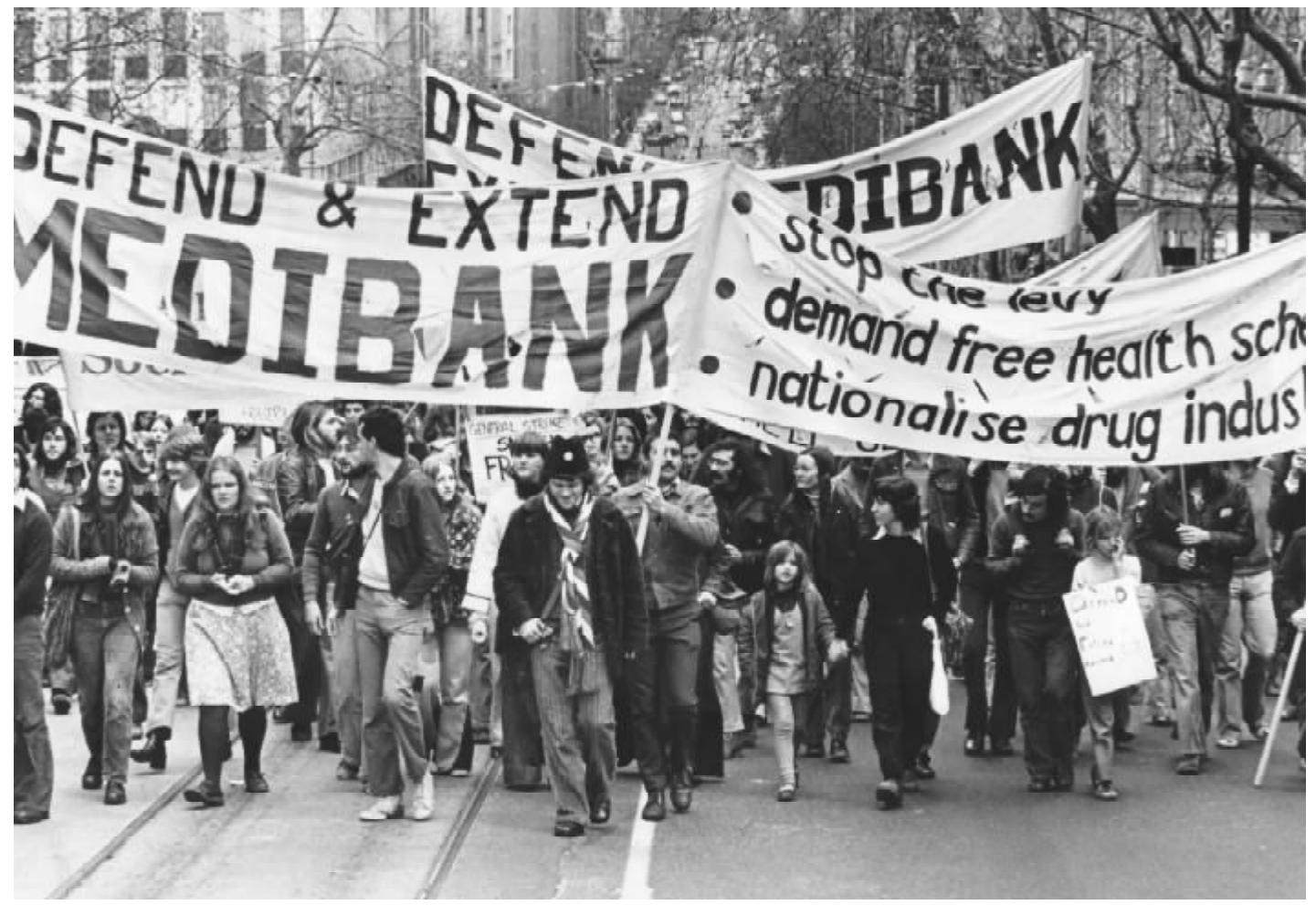
March to defend Medibank, July 1976, Sydney.