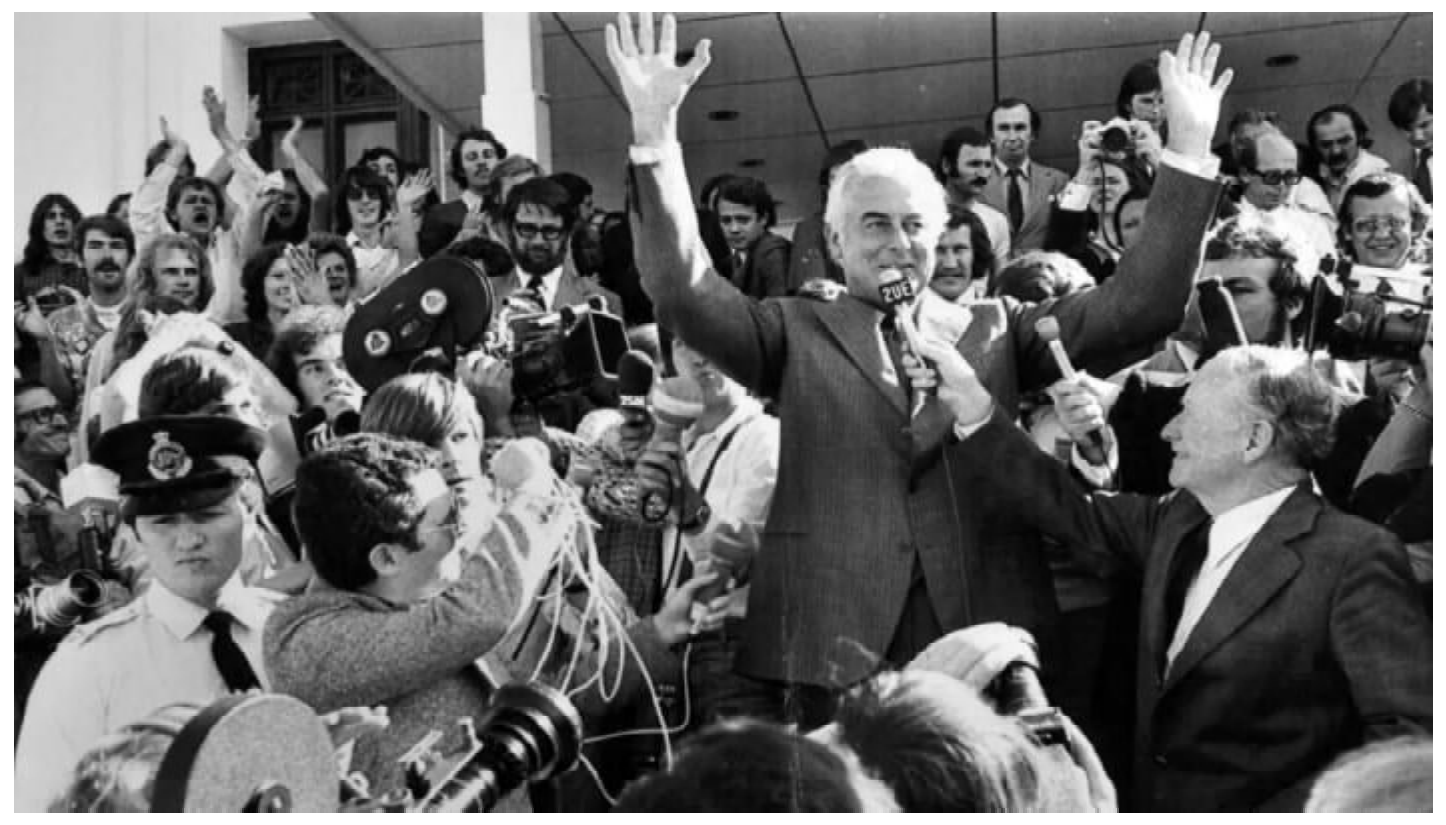
November 11, 1975: Gough Whitlam on steps of Palriament after sacking.

campuses and spread to broad layers of society from the 1960s to the early 1970s.