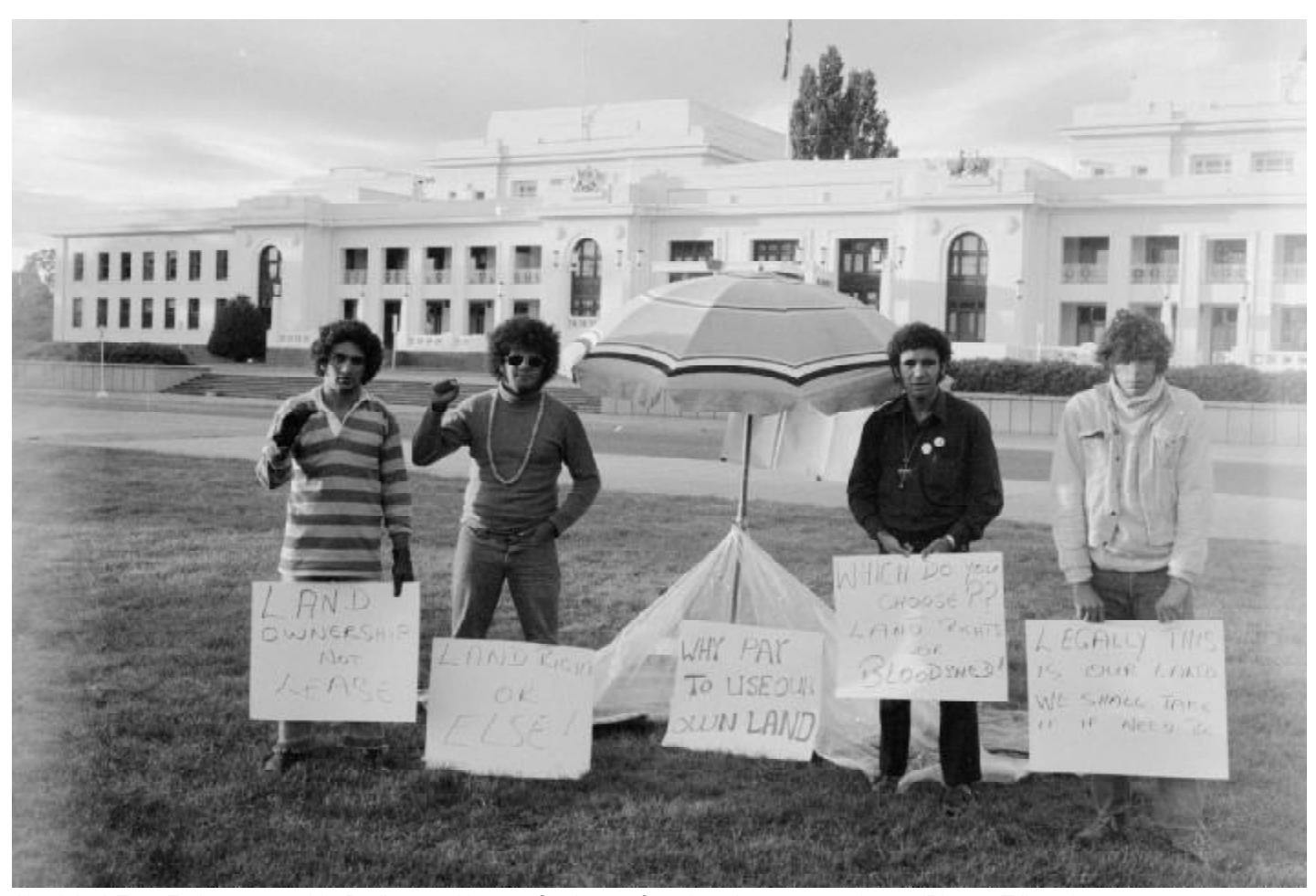
Aboriginal Tent Embassy, outside Parliament House, Canberra, first day, January 26, 1972.

"Five police went to hospital — two for knuckle lacerations, assaulted by a demonstrator's teeth, one for a sprained shoulder, assaulted by a demonstrator's head. Altogether 18 people were arrested. A number were bashed by police in the cells."