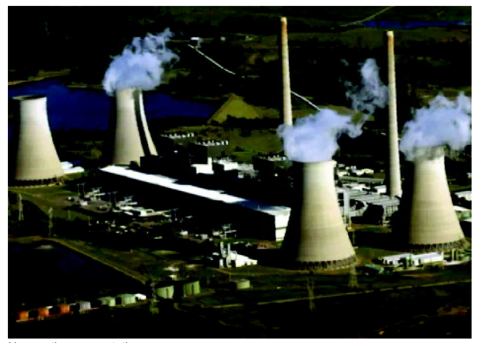
Newcastle power station.

Optional preferential, or Just Vote 1, in practice means a return to the undemocratic first-past-the-post system operating in Britain and the US. ■